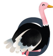
Around the ostrich's body