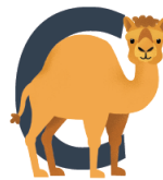
Curl around the camel's back