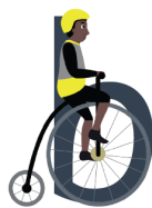
Down the person and around the wheel