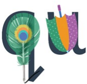
Around the feather and down the pen