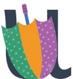
Under and up the umbrella, down to the tip