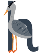
Heron - from his head to his feet, up and over his back