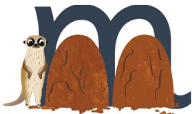
Meerkat, mound, mound