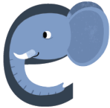
Around the head and down the trunk