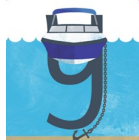
Under the hull and down to the anchor