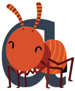
Around the head, down the body