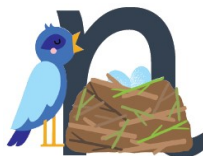
Down the bird and over her nest