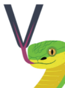
Viper - down the tongue, up the tongue